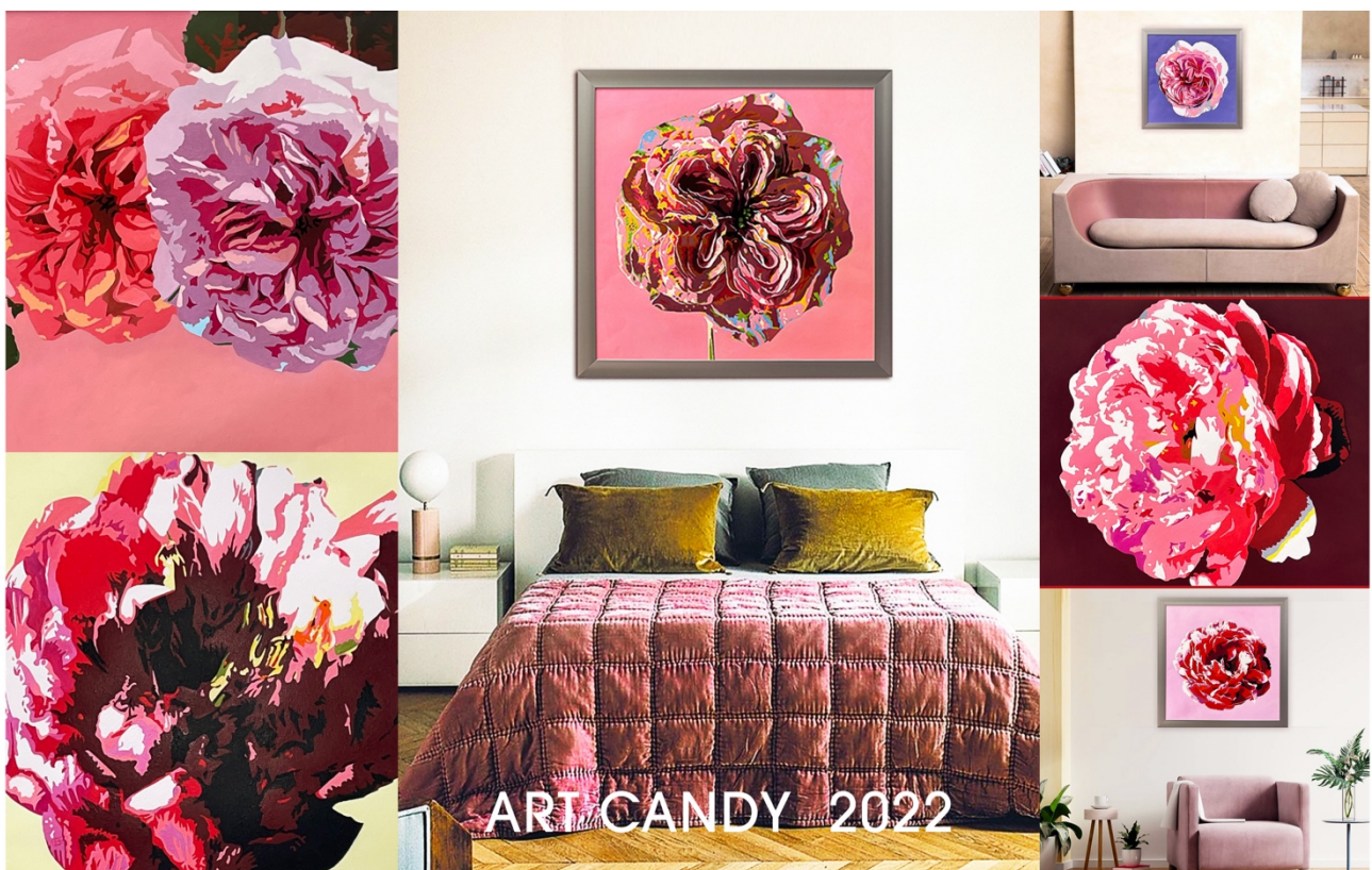
Bettina Newbery: A selection from Art Candy, 2022 – centerpiece BLOOM XXVIII ROSE SUGAR

Below you see a compilation of favourite artworks from the 2022 series ART IN BLOOM .