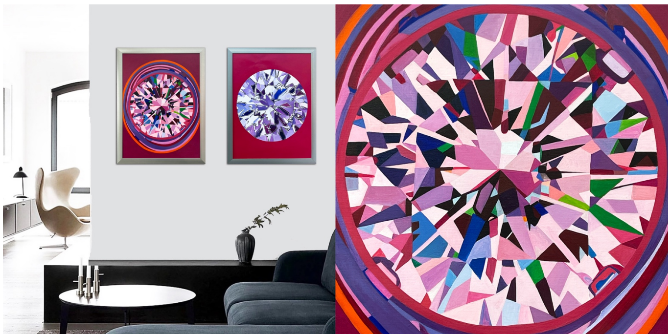
Bettina Newbery, STAR VII – V1 AUBURN, STARDUST series, 2022|23

BN: Far beyond a mere decorative piece, STAR V – VI ORIEL is an adventure into the vast expanse of the cosmos within your own home, a magnificent one-of-a-kind work of art that serves as an enchanting portal to other worlds.