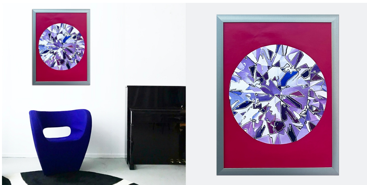
Bettina Newbery, STAR VI – VI AMETHYST, STARDUST series, 2022|23

Every painting in the STARDUST series is a unique and hand-painted one-off creation, adding an atmospheric touch and contrast to any room, and now available as single or grouped items on KOONESS - https://www.kooness.com/artworks/?galleries=1175&order_by=recent&page=1