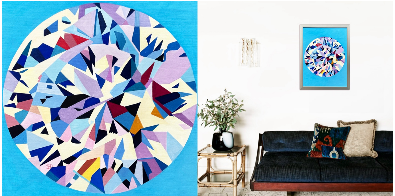
Bettina Newbery, STAR V – V1 ORIEL, STARDUST series, 2022, Courtesy VISIONAIRE LONDON ®

Insert Image no. 4 - 2022-STAR-V-ROOMVIEW-01a.jpg